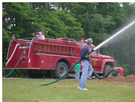
Testing a newly installed hydrant in Owen County

This grant will soon be drawing to a close. If you are interested in installing dry hydrants in your county, contact the Sycamore Trails office soon.